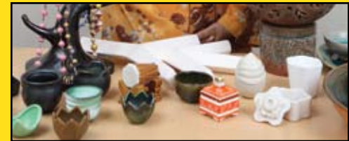
Modernising one of the world's oldest forms of art