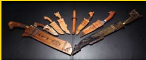
Saving the art of the Bajau blacksmiths