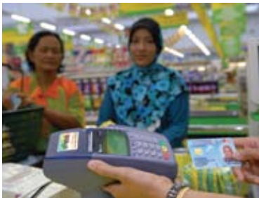
SMART CARD: There are now more than 50 MyKad applications.

One of the pioneer MyKad projects undertaken by the Multimedia Development Corporation (MDeC) is to work with the MyKasih