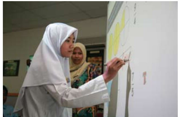
SMARTER LEARNING: An interactive whiteboard makes learning more fun.

“The ministry is playing a strategic role in generating interest and awareness in science, technology and innovation among the young,” said Science, Technology and Innovation Minister YB Datuk Seri Dr Maximus Ongkili at the launch of