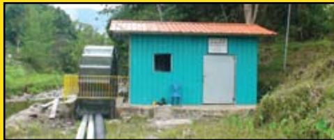
From waterwheel dynamo to mini-hydroelectric generator system